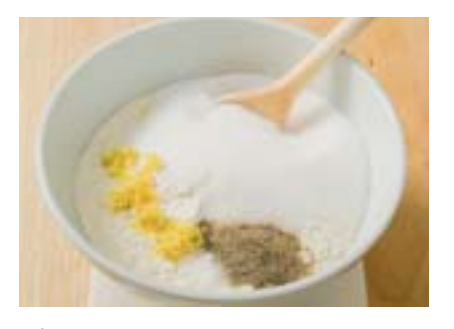
1 Chill the ingredients first. Mix together flour, sugar, grated lemon zest, salt and vanilla sugar. Cut the cold butter into cubes.