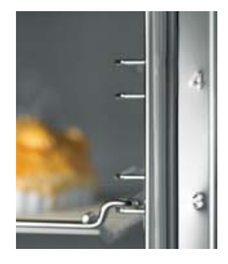
Cooking with ease: The shelf levels are clearly marked on the front of the oven cavity.