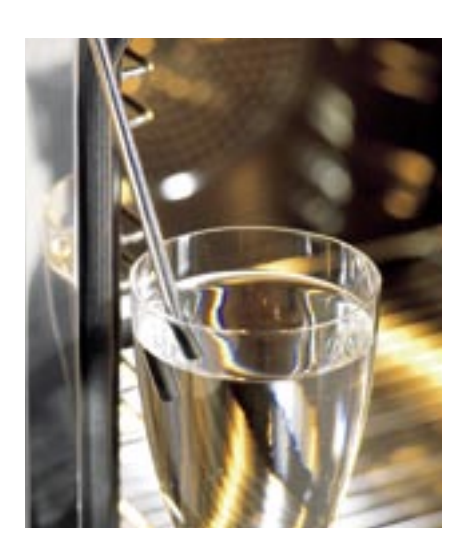
The filling tube is pulled forward and the quantity of water required is drawn in automatically.