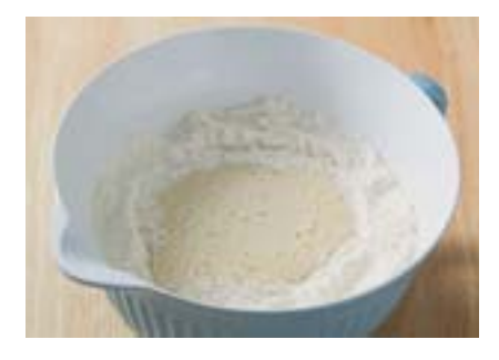
1 Put the flour in a bowl and make a well in the centre. Dissolve the fresh yeast and sugar in lukewarm water, pour into the well and work a little flour in from the edge.