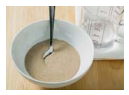
1 Stir rye flour and lukewarm water together to create a thick porridge. Cover and leave for several days until the dough is grey and produces bubbles.