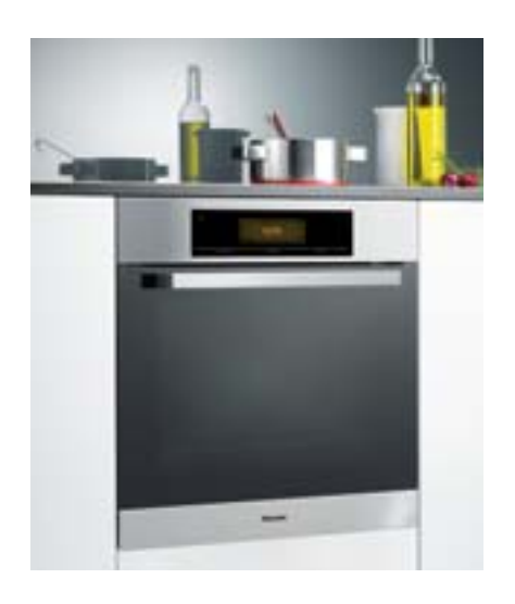
The display is exceptionally easy to use and is highly intuitive.

We recommend using the Fan plus function for baking and roasting on several levels at the same time. A lower temperature can be selected than for Conventional heat as the heat is distributed around the food by the fan. Select Bottom heat towards the end of the cooking time, for example to finish off pastry bases. Intensive bake is ideal for dishes which require a moist topping and a crisp base, such as pizza. Select Economy grill for grilling flat items and browning the tops of small dishes. The Full grill is more suited for browning large dishes and grilling bigger items. The Fan grill is excellent for mixed grills and chicken pieces. To avoid having to seal large pieces of meat on the hob, simply select Auto roast and at the outset select the temperature you want the meat cooked at. The oven will then do the rest. Moisture plus will produce optimum results when cooking not only bread and cakes, but also roasts, baked dishes and pizzas as moisture is used in addition to Fan plus. Food will be moist and tender on the inside and crispy on the outside. All recipes in this book which use the Moisture plus function are marked with the oss symbol. On ovens without the Moisture plus function, select Fan plus.