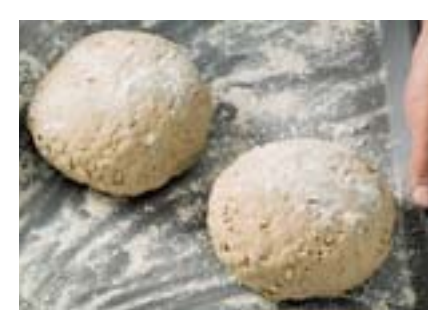
6 Cover and leave to rise for 1 hour. Form one or more loaves from the dough. Place on a floured baking tray and leave to rise for another hour.