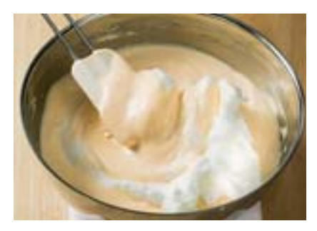
3 Carefully fold in one third of the egg whites. Stir in the remaining egg whites. Use immediately.