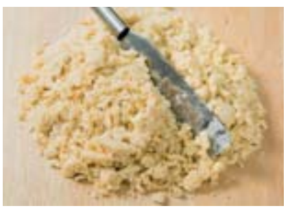
2 Either place the ingredients on a work surface and cut the butter into the flour with a spatula, or use a food processor. Knead in the egg.