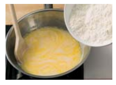
1 Bring water, milk, butter, sugar and salt to the boil. Tip in the flour and stir in quickly with a wooden spoon until the dough forms a ball.