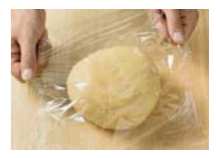
3 Wrap the pastry in clingfilm and chill in the fridge for at least 30 minutes. The pastry can be kept in the fridge for up to a week and can also be frozen.