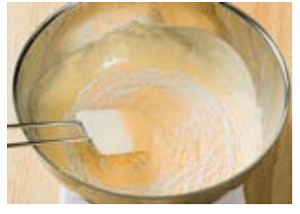
2 Sieve the flour into the egg yolk and sugar and stir in. Stir in melted butter if directed to by the recipe.