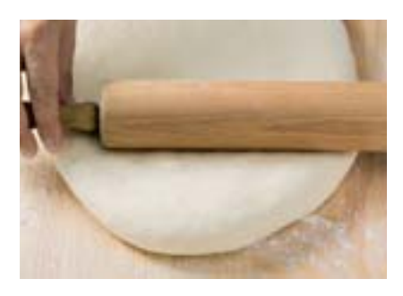
3 Knead the dough again briefly and roll out on a floured surface. Proceed according to the recipe and allow to rise for a further 15 minutes before baking.