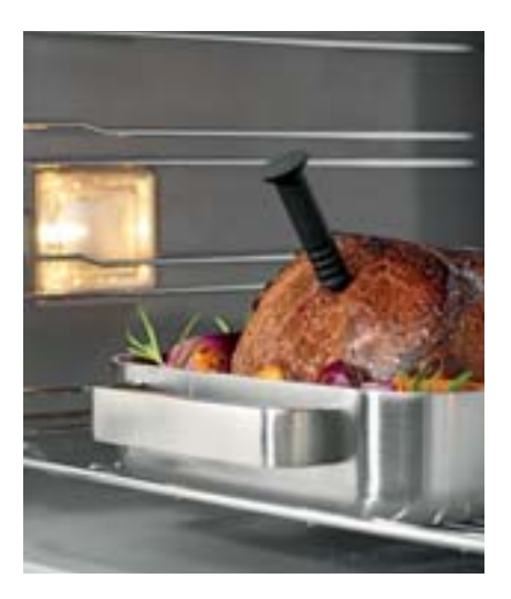
Precise roasting: The food probe measures the core temperature.