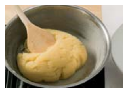
2 Stir the ball of dough until it comes away from the base of the saucepan. Mix for another minute.