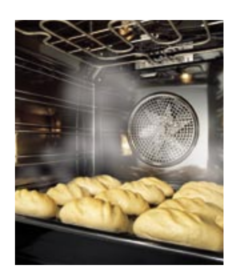
Rolls baked in an oven containing moisture are light and cooked to perfection on the inside, with a good crust on the outside.