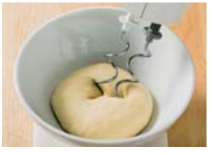
2 Using the kneading hook of an electric mixer, knead to an elastic dough. Rub the dough with oil, wrap in clingfilm and leave to rest for 1 hour.